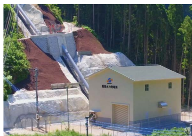
Kamoshishi Hydroelectric Power Plant

1,990kW (operation started in September 2018)