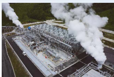
Sugawara Binary Power Plant

5,000kW (operation started in June 2015)