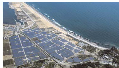
◆Renatosu Soma Solar Park

52,452kW (operation started in June 2017)