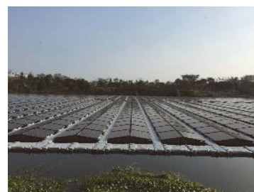
◇SuGu I / II Power Plant

5,153kW (operation started in April 2018)